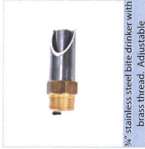
3/4" stainless steel bite drinker with brass thread. Adjustable