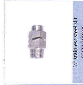
1/2" stainless steel spray drinker