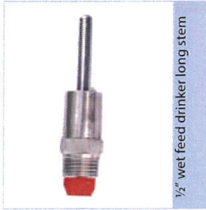
1/2" wet feed drinker long stem