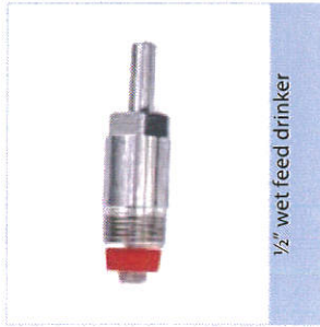
1/2" wet feed drinker