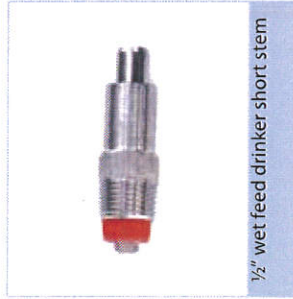
1/2" wet feed drinker short stem