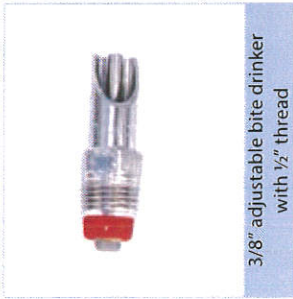
3/8" adjustable bite drinker with 1/2" thread