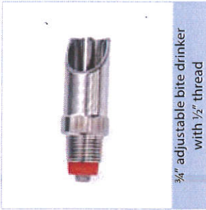
3/4" adjustable bite drinker with 1/2" thread