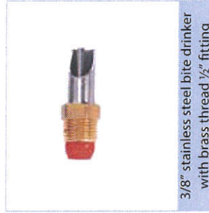
3/8" stainless steel bite drinker with brass thread 1/2" fitting