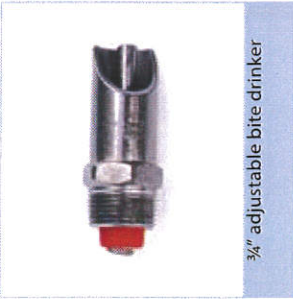
3/4" adjustable bite drinker