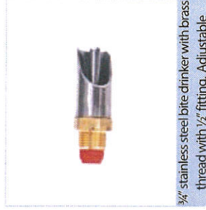
3/4" stainless steel bite drinker with brass thread with 1/2" fitting. Adjustable