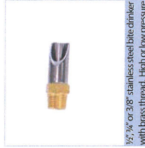
1/2", 3/4" or 3/8" stainless steel bite drinker with brass thread. High or low pressure