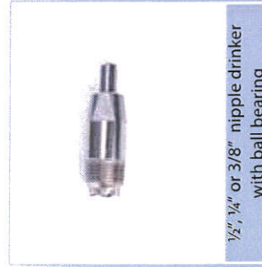
1/2", 1/4" or 3/8" nipple drinker with ball bearing