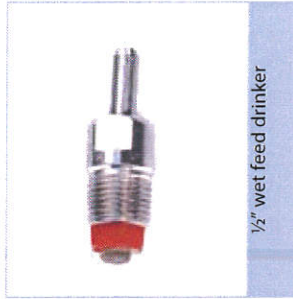
1/2" wet feed drinker