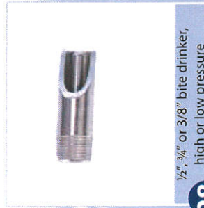
1/2", 3/4" or 3/8" bite drinker, high or low pressure