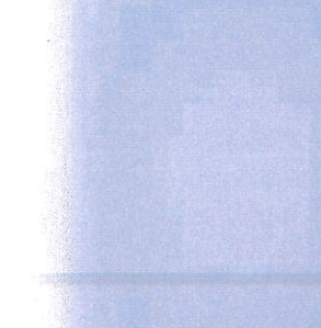
1/2" stainless steel slit spray drinker