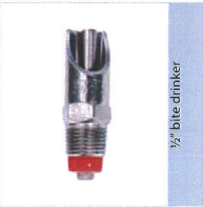
1/2" bite drinker